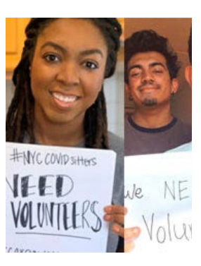
NEW YORK, NY